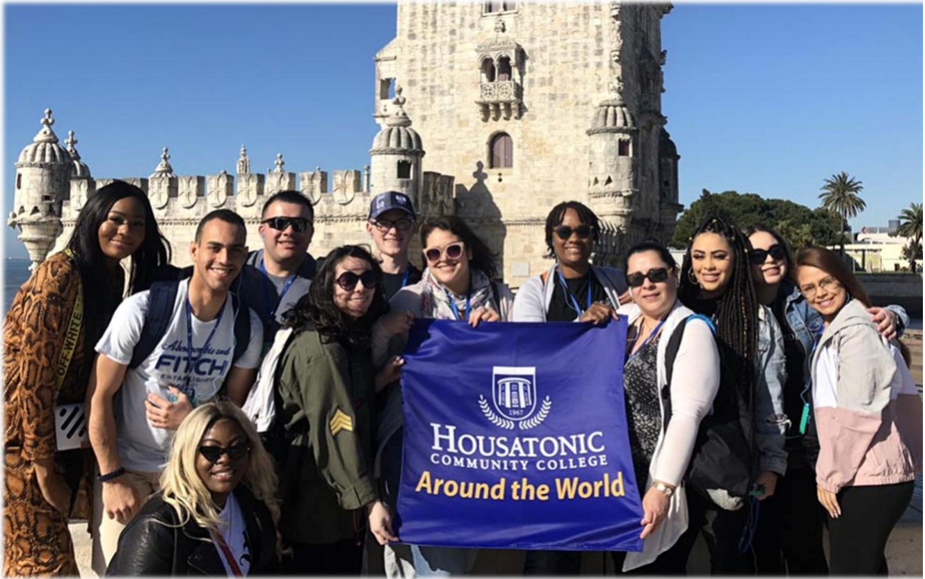
The Tower of Belem in Lisbon, Portugal, Spring 2019.

Study abroad is an increasingly important part of the college experience. Exploring new cultures can be life changing, and many students point to their time abroad as the defining aspect of their education. HCC offers the opportunity to travel internationally and earn college credit. Faculty-led international education programs offer a great alternative to the traditional study abroad experience. Competitively priced, these tours give you the flexibility to take your coursework around the globe in just 1-2 weeks