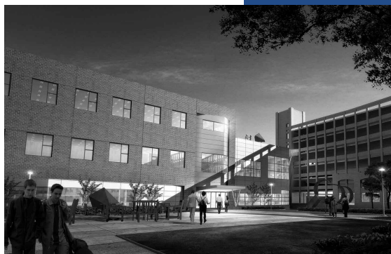
Architect's rendering of HCC's Beacon Hall