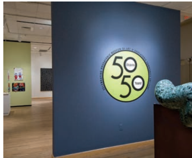
» "50 Objects/50 Years" - an exhibit that kicked off the celebration of the founding of the Museum by Burt Chernow.