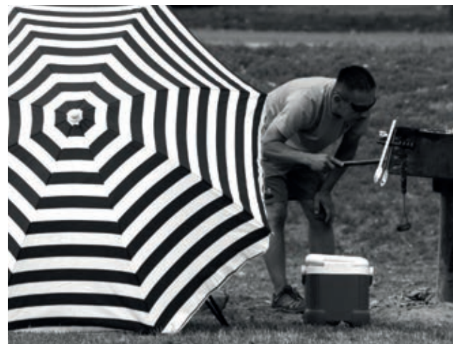
» "Man Barbequing Next to Umbrella", from the exhibit Larry Silver: "Then and Now".