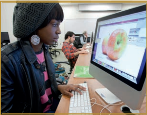
» Some scholarships from Foundation donors are earmarked to support specific areas of study. These scholarships enable students focused on certain career paths to complete their HCC studies then enter the workforce or transfer their credits to four-year academic institutions.